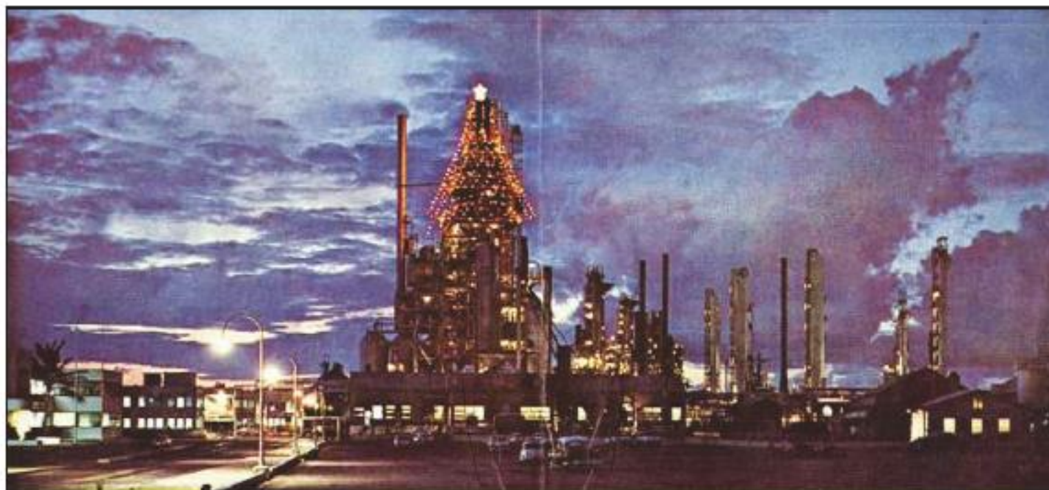
The world's tallest Xmas tree at the refinery after the WWII blackout ended